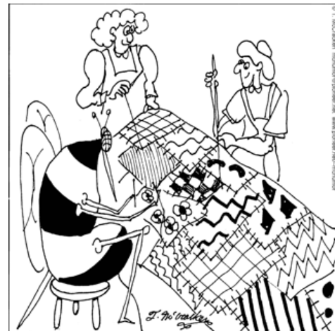
A Quilting Bee.