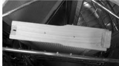
Holds 3 6\frac{1}{4} " (15.88 cm) Frames