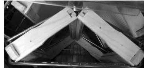
Holds 6 5\frac{3}{8} " (13.65 cm) Frames