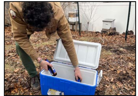
State official load the beers into a cooler. “It’s important to keep them well chilled”. The beers will be relocated to a liquor store in Worcester County.